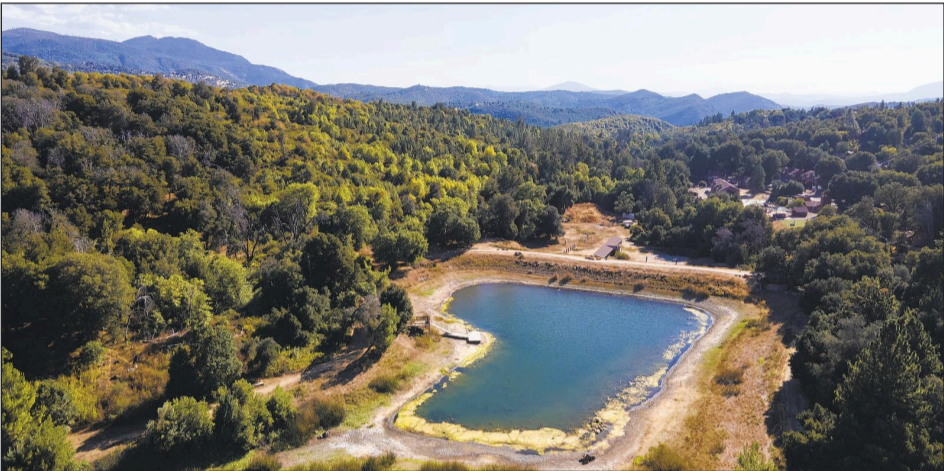
Man-made Lake Jessop at the YMCA's Camp Marston in Julian has been a victim of drought over the years. The overnight youth camp sits on 200 acres.

To re-forest the hills blackened by the fire, the Camp Marston staff planted 40,000 pine seedlings donated by the California Department of Forestry. During the driest months that year, youth campers walked into the hills each day and watered the baby trees with small water-filled milk cartons.