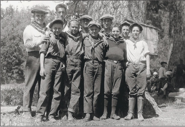
Boys at Camp Marston in 1923.