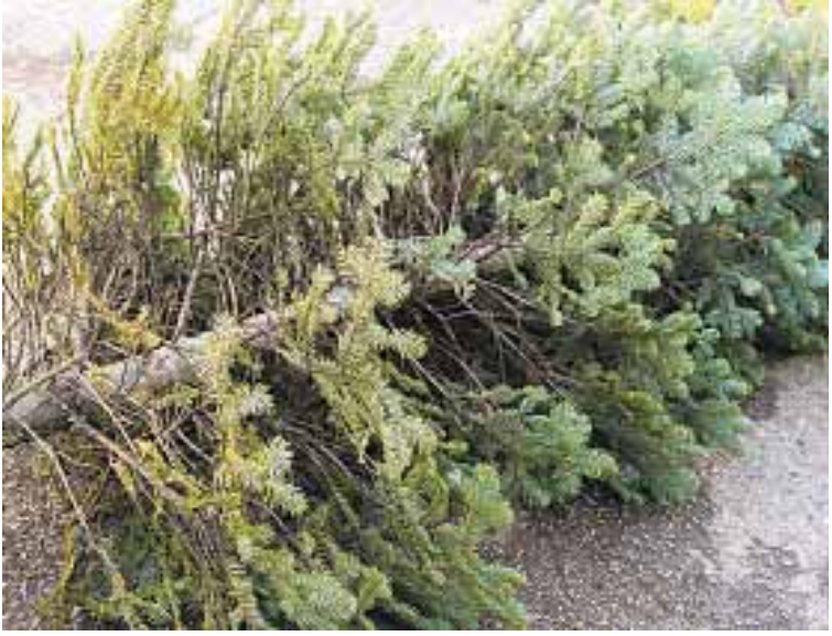
This week's conflict was caused by a discarded Christmas tree and the rules of a homeowners association.

Subtlety is powerful here. If you pointedly call out the guilty neighbor and the recalcitrant HOA management, you will spark the feud you are rightly avoiding. You don't have to go there. They already know they're wrong.