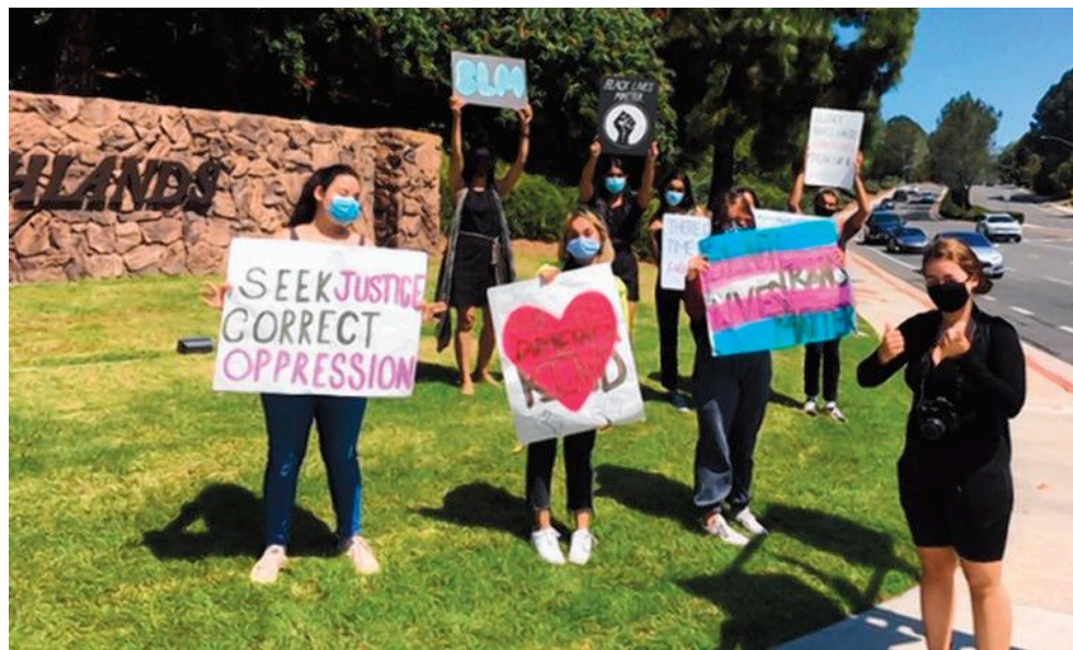
Carmel Valley for Equal Justice protesters on a recent Saturday.