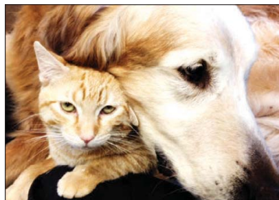
Dan Walker, a cat rescued from the streets of Tijuana and Pilot, a golden retriever rest from their duties at skilled nursing centers as part of Helen Woodward Animal Center's Pet Encounter Therapy program.