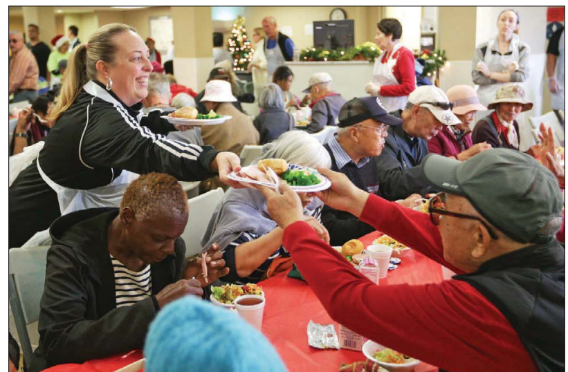
More than 250 volunteers at the San Diego Rescue Mission served more than 1,000 meals to the homeless for its Christmas Outreach Meal.

NCRC was founded in 1983 by the University of San Diego Law Center and the San Diego County Bar Association . NCRC is recognized as an international leader in mediation instruction and conflict resolution. Visit ncrconline.com .